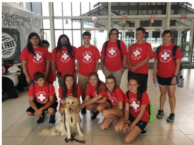
National Youth Gathering