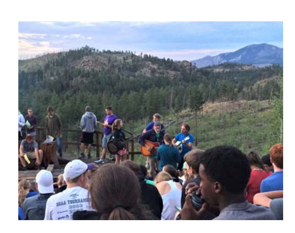
Registrations for Kansas District Summer Camp are being taken. Camp Dates are July 15-20, 2018