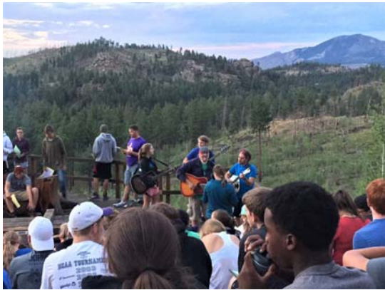
Registrations for Kansas District Summer Camp are due. Dates are July 15-20, 2018

Youth Meeting Wednesday, May 9 at 8:00 pm Meeting Room Discuss Youth Activities and Studies!