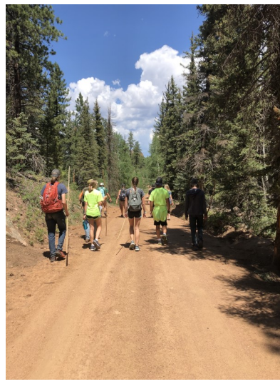
Highlights from Trinity's senior high summer camp at LVR.

Donations can be brought to the church beginning August 3!