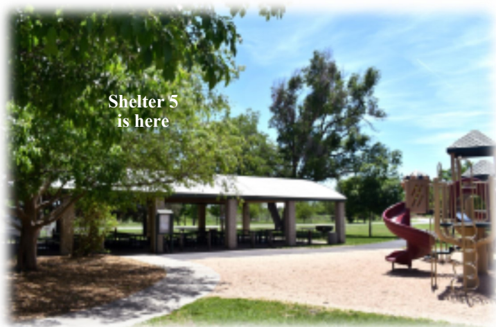
Shelter 5 is here

Come for Spiritual and Relational Growth!