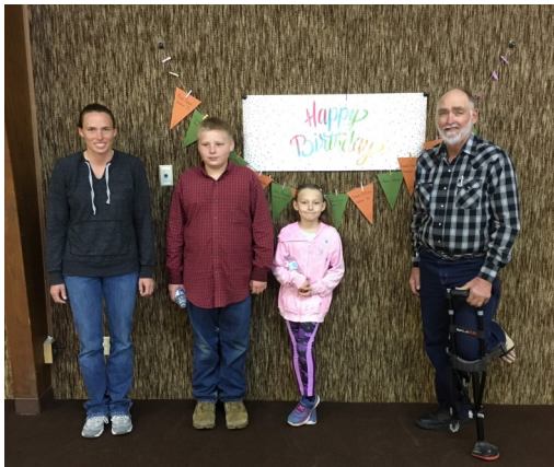
Next celebration will be Sunday, December 6 at 10:30 Pictured are those celebrating November birthdays.