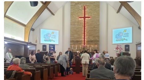
February's Little Lamb's Celebration