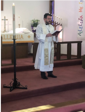
Easter at Grace

1304 Mattie Street PO Box 46 Lakin, KS 67860 620-355-7161