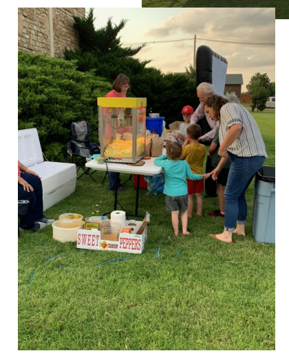
Friday July 16<sup>th</sup> is our next Family Movie night 7:00 pm