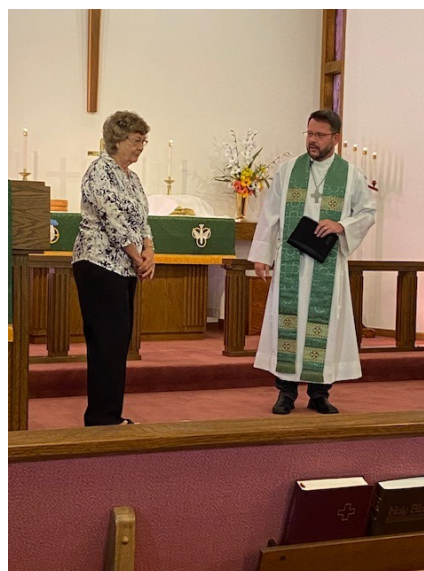
Immanuel will have a LWML Work Day on Tuesday, October 12 at 9:00.