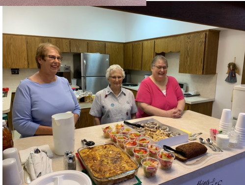
Winkel at Grace September 14