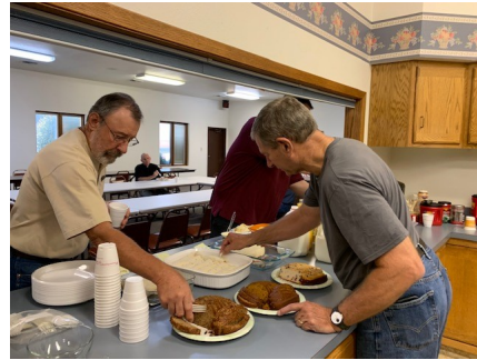
Monthly Men's Breakfast September 11