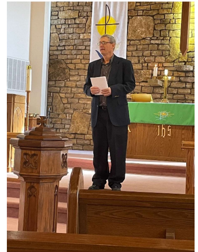
Right: Elder led service at Immanuel

March 8 9:00 AM LWML Workday March 12 8:00 AM Men's Breakfast @ Immanuel