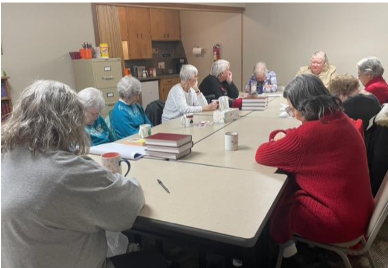
Get Together Girls having devotion and prayer before they begin their card ministry.

Non-Profit Org Prsrt Std U.S. Postage Paid Garden City, KS Permit # 143