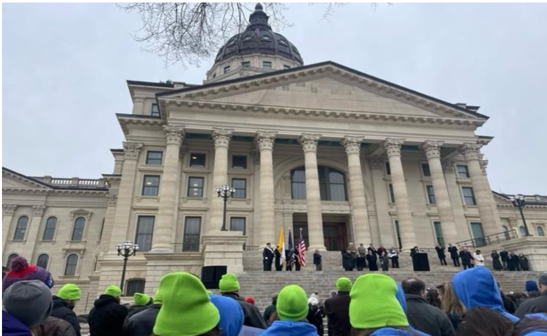
Trinity was at this year's March for Life in Topeka. Family at all ages is a core value at Trinity.