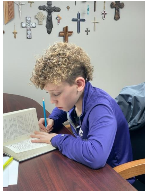
Harvick actively engaged in God's Word During Confirmation class. Scripture Alone being practiced.