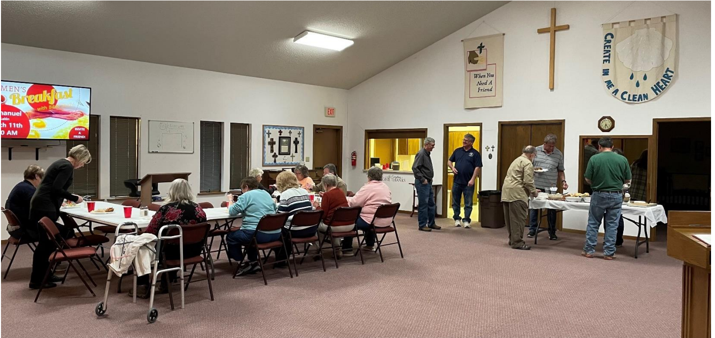
Dinner after Lenten Midweek Service at Grace Lutheran, Ulysses.

March was a busy month for T. I. G. with voters meetings and other wonderful fellowship gatherings! Here are a few photos of these events. Hope you enjoy seeing them!