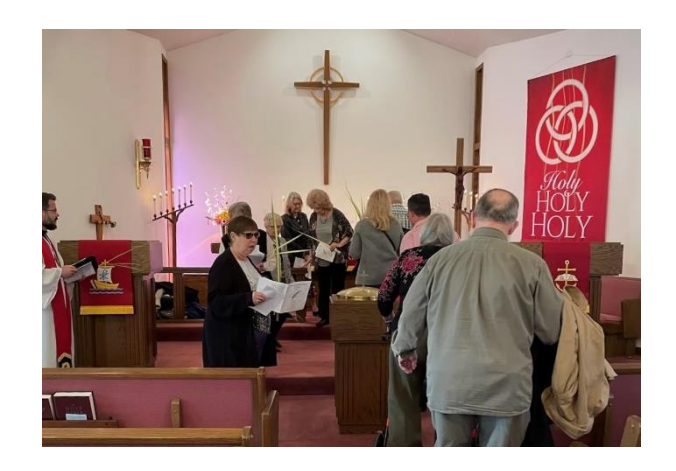
Coat Drive on Palm Sunday at Grace. Thanks to all who donated coats!