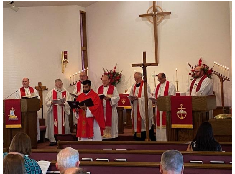
The Congregation is promising to support him in the Pastoral Ministry