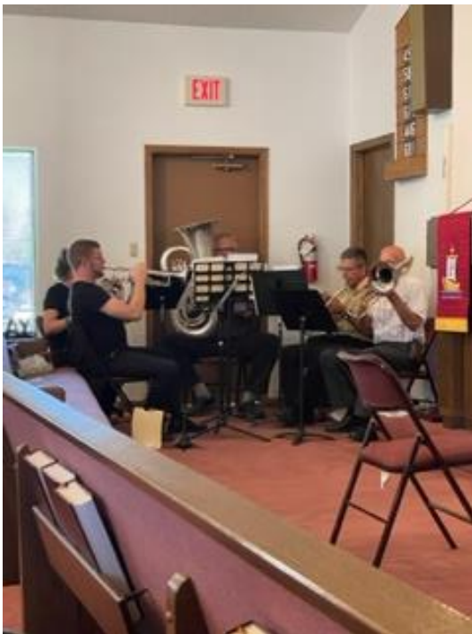
The Brass Group They sounded great!