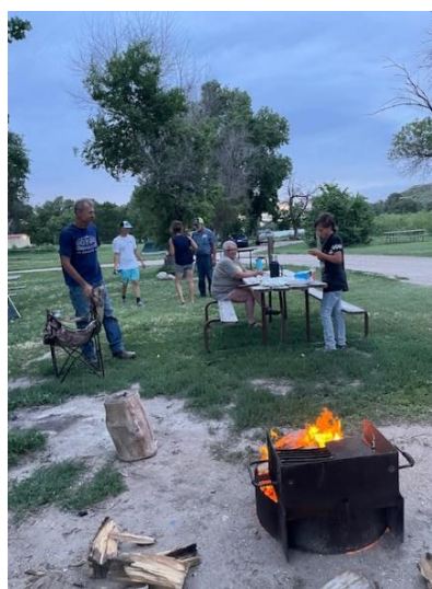
Trinity Lutheran Campout Weekend!

Church Ministry JDC PieceMakers Quilting: since 2013 ladies from Trinity Lutheran Church work with youth from the Juvenile Detention Center to make quilts to donate to various organizations. They have made over 600 quilts. Each quilt made by them has a heart on it, a suggestion made by one of the youths after hearing a heartfelt devotion.