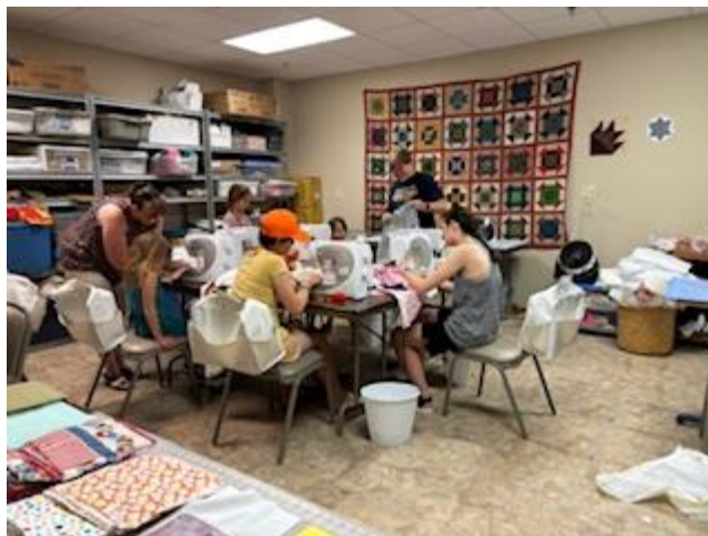
Photos of PieceMakers Summer Sewing shown