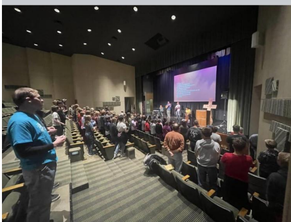
Middle School Huddle