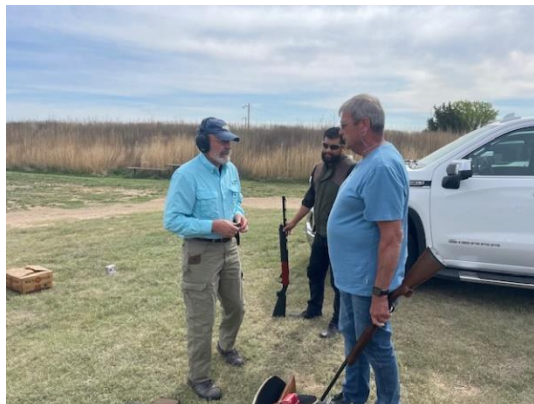
Men's Breakfast & Shoot Skeet