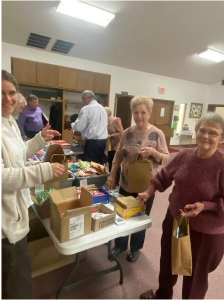
Grace Lutheran's Family Fun Night!