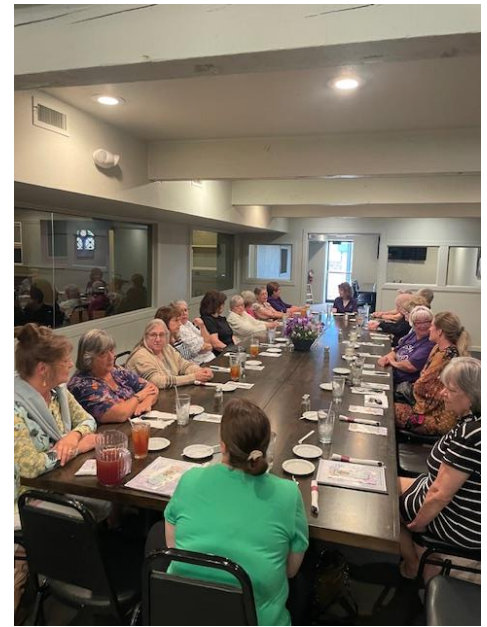
LWML Ladies Night Out!