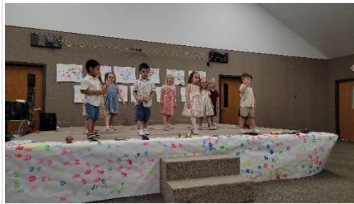
Pre-school Program - 3yr olds