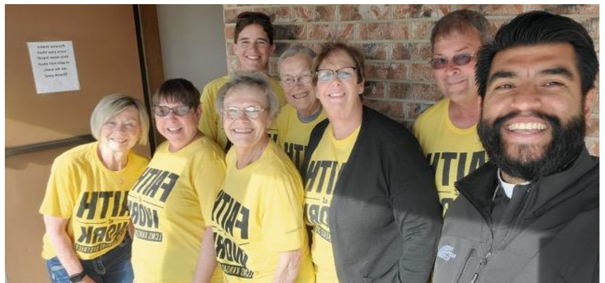
Faith At Work at Grace Lutheran Church!