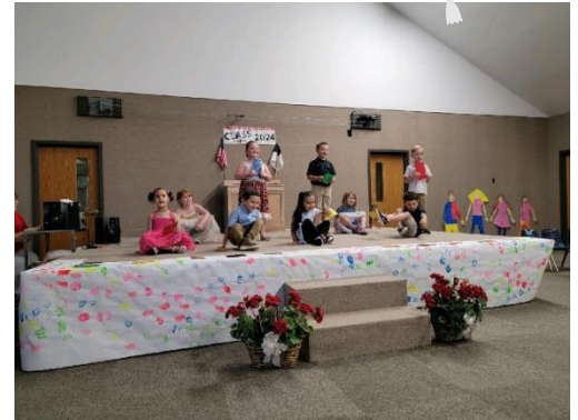
4yr olds Graduation