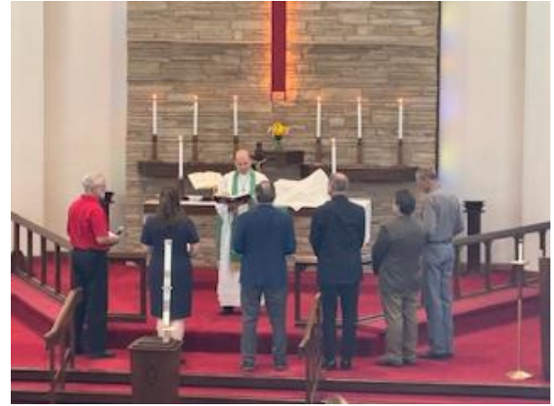
Installation of the new Deaconess at Trinity Lutheran Church. Held on July 7th