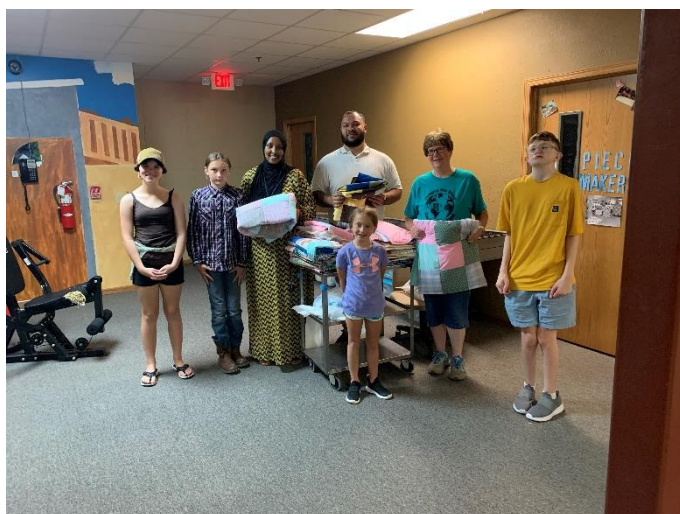
Distribution of quilts to Catholic Charities