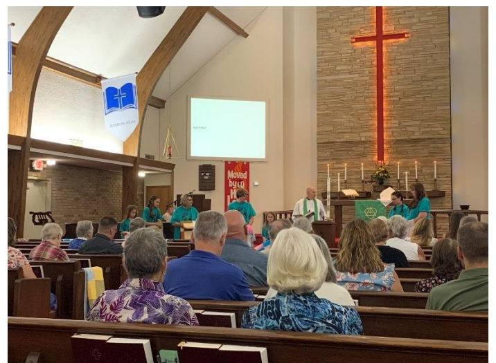
Blessing of the quilts.