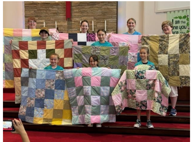
PieceMakers Summer Sewing gearing up for the blessing of the quilts. The quilts were blessed on Sunday, July 21 st .