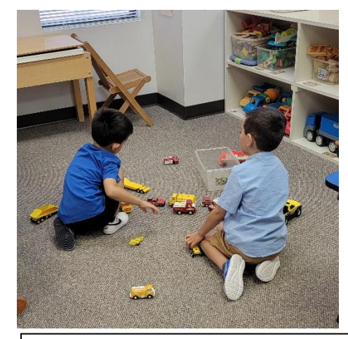
Trinity Preschool 1<sup>st</sup> day of school.4yr olds