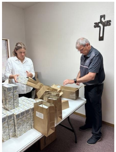
Community Involvement at Grace Lutheran Church.

For the past 10 years Grace Lutheran through the generosity of congregational members, has purchased supplies for the teachers in their community that are most frequently used items, such as post- it notes, dry erase markers, Kleenexes, pencils, etc, the supplies are bagged up and delivered to 4 schools. Included in the bags are also a motivational card as well as a bookmark with Worship Service information.