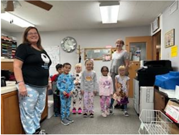
Preschool Pajama Parties!