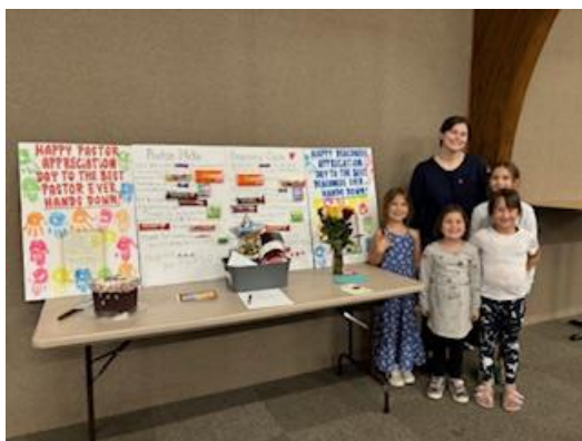
Pastor Appreciation Month & Deaconess Appreciation Day at Trinity Lutheran Church. We love you guys!