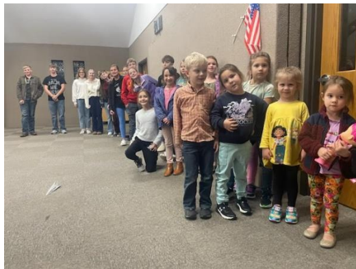
Trinity Lutheran Movie Night at the Theater in Garden City!

Community Thanksgiving Dinner Preparations