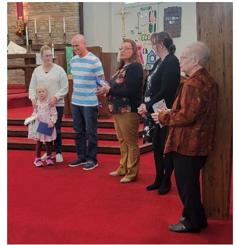
Little Lamb Sunday!