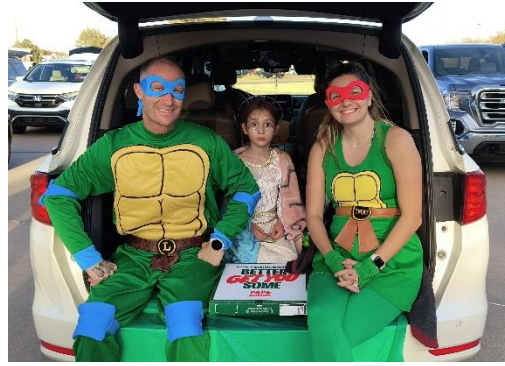
Trick or Treat at both Trinity Lutheran Church and Grace Lutheran. What fun!