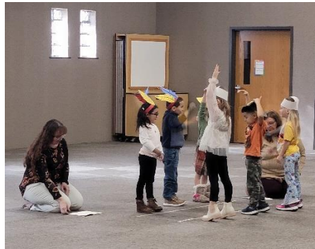
Preschool Thanksgiving Day Program.