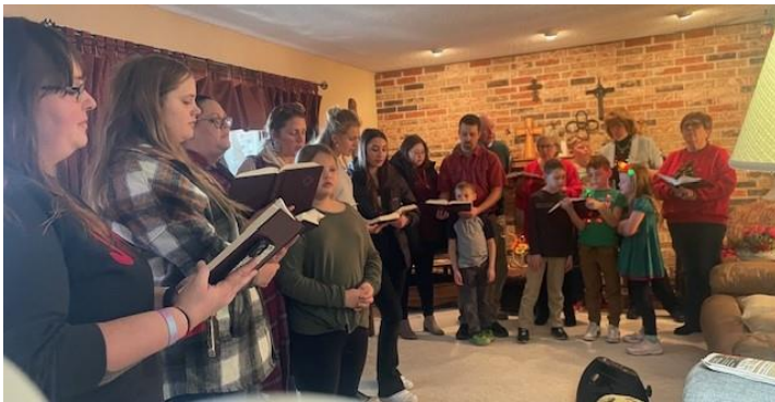
A caroling, a caroling, a caroling we go!