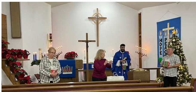
Grace Lutheran 4 th Sunday in Advent