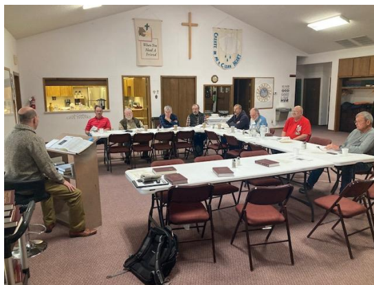
Men's Breakfast at Grace Lutheran Church