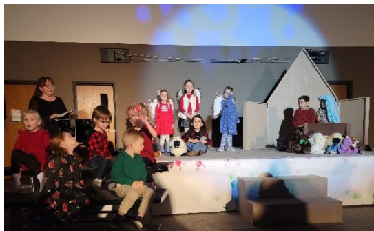
Trinity's Preschool Christmas Program