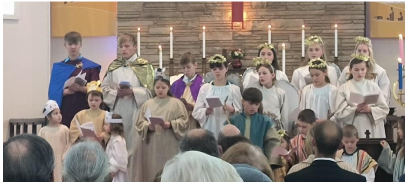
Children's Christmas Program at Trinity Lutheran Church