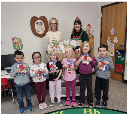
Trinity's Preschool giving their collection for Santa for Seniors.