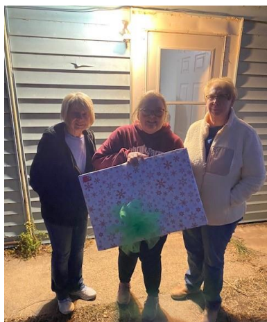
Grace Lutheran Church delivering gifts to families. What a joy!