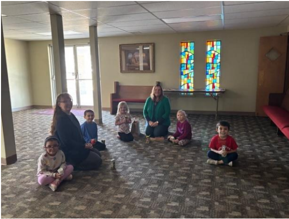
Preschool studying L Day. They had lunch in the Narthex.