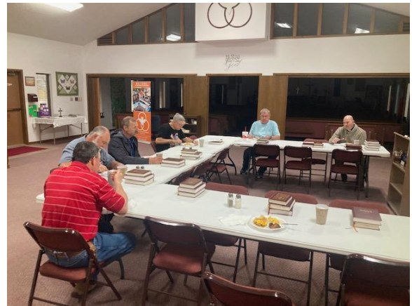
Men's Breakfast at Grace Lutheran Church in Ulysses.