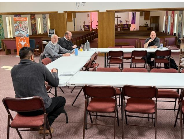
The Winkel held at Grace Lutheran Church on March 11th